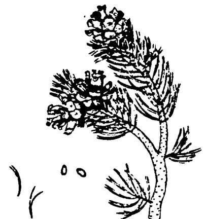
FIG. 28. Pinus edulis , Pinyon Pine