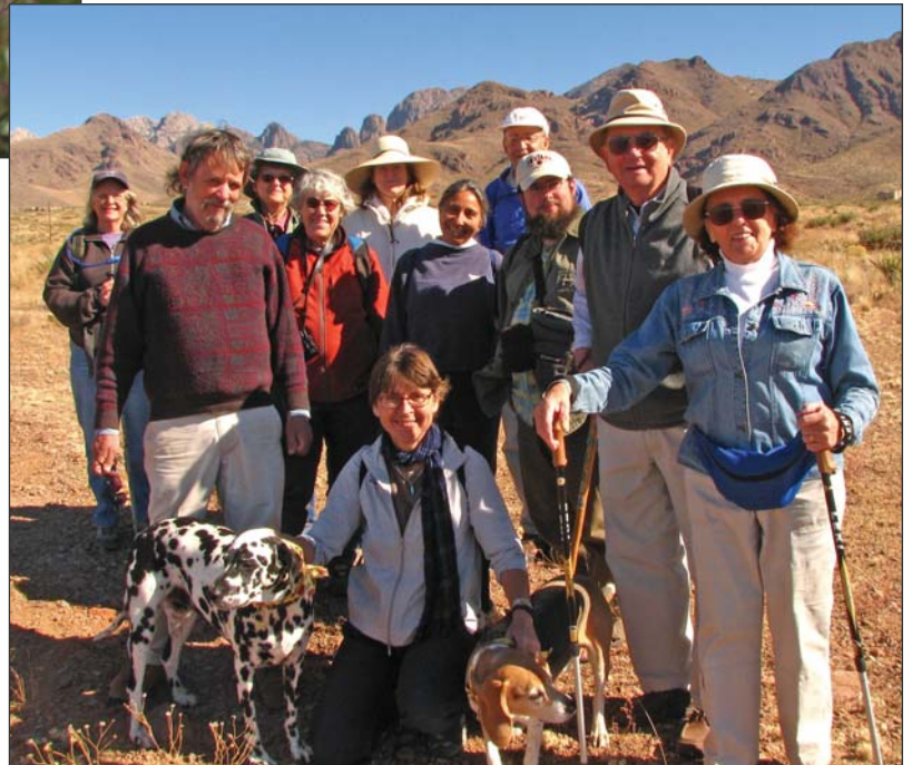
Happy Las Cruces hikers, Sierra Vista Trail, Organ Mountains.

For additional information, please visit www.npsnm.org/events/2016-annual-meeting