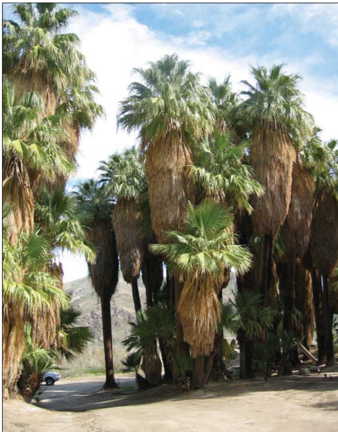
California's native palm tree, Washingtonia filifera .