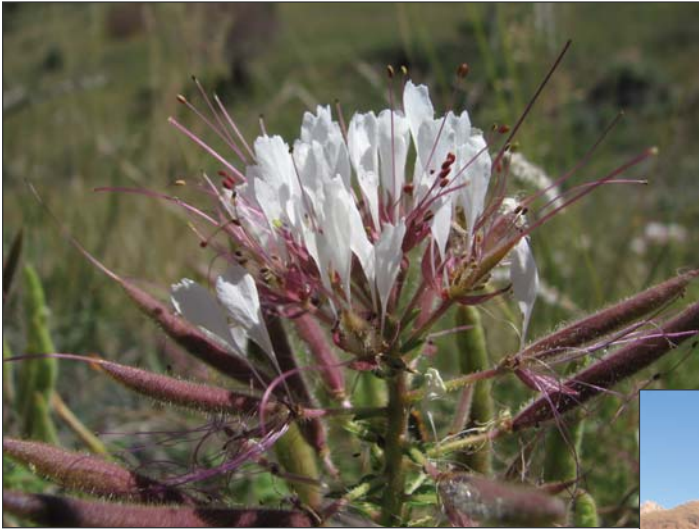
Clammyweed ( Polanisia dodecandra ).

Medium. This beautiful canyon is very close to I-25, for those of you heading north. It can have a great variety of plants, some that we do not frequently see. Limit: 15