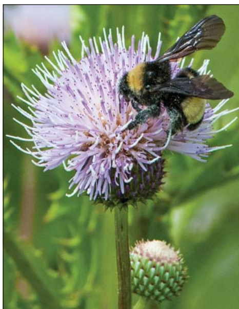
Left: Sacramento Mountains thistle and Rufous Hummingbird; Right: Wright's marsh thistle and American Bumblebee.