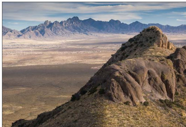
The Organ Mountains.

As we sat at a local restaurant to begin planning for the 2016 annual meeting in May of 2014, it was very easy to come up with a theme, since that was the day President Obama publicly announced the designation—and we sat watching him live on a laptop! He even mentioned plants in his announcement: “The area is home to a high diversity of animal life, including deer, pronghorn antelope, mountain lions, peregrine falcons and other raptors as well as rare plants, some found nowhere else in the world, such as the Organ Mountains pincushion cactus. ” What an emotional beginning to annual meeting planning!